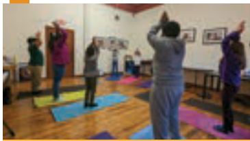
HERE to Play

Our HERE ("Health & Emotional Recovery Education") to Play Initiative recognizes that our students deal with traumas and stresses that can significantly impact their physical and mental health. HERE to Play includes access to physical outlets within our programming day such as yoga, music therapy, meditation, martial arts, and dance.