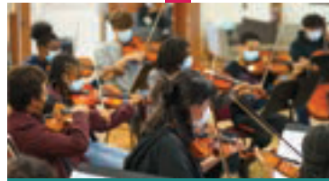
Student Ensembles & Quartets

Music Bridge began as a violin class serving recent immigrants and refugees. Now those students are veterans, and play alongside and mentor new arrivals. This class builds relationships and communication skills across boundaries of language and culture.