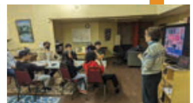
College & Career Pathways

All of our students are presented with the opportunity to be tutored by excellent instructors. Students are tutored in subjects like math, reading, and science. Students who have gone through this program have seen great improvements in their respective subjects.