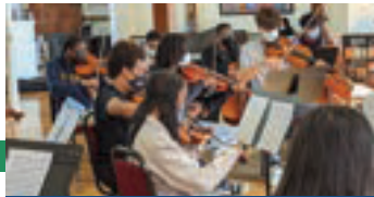
Harmony In Action

In a Suzuki playdown, students play together through a cumulative review of pieces they've learned from the Suzuki method, from the most advanced song they know all the way down to Twinkle, Little Star.